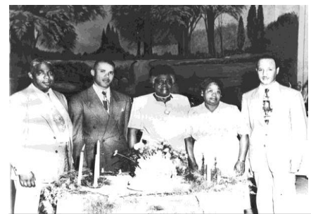
Mary McLeod Bethune and her family