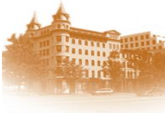
NCNW National Headquarters 633 Pennsylvania Avenue, NW Washington, DC 20004

Full article available online: http://www.ncnw.org/Saga-The%20Pearl.pdf